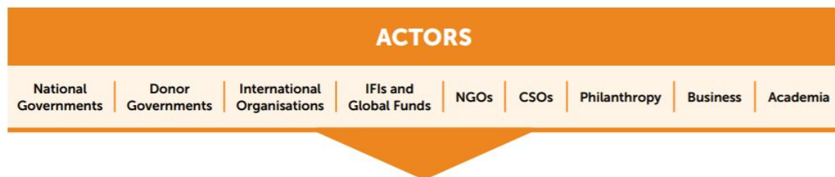
Figure 4. Actors involved in school reopenings and promoting safe schools (Theirworld, 2018).

Widespread alignment and transparency is necessary to ensure a unified response to school disruptions. Coordination among actors allows for buy-in and collective decision-making on back-to-school initiatives and timing. It can prevent mixed messaging to learners, parents and families about returning to school. High involvement from community support groups and school committees can positively impact the return-to-school process. These groups can support data collection and facilitate interaction with parents who may be hesitant to send their children to school (UNICEF, 2013). For example, youth community groups in Sierra Leone played an important role in monitoring Ebola cases and improving educational responses (Berry, 2015). Raising awareness about the plan can also help build confidence in school reopenings.